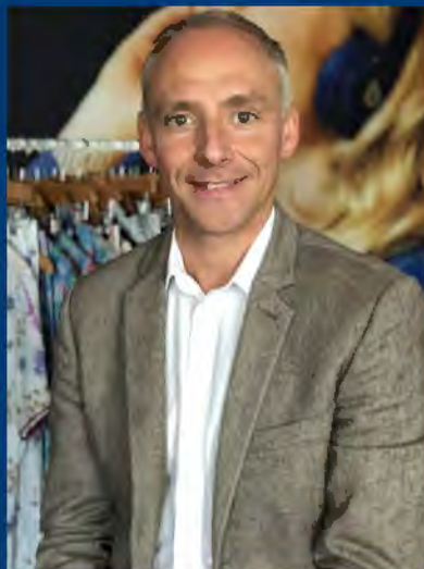
Mark Tweed Cyber Jammies

"Waterhouse ticks all the right boxes. Cost is incredibly important - that was the starting point. The business support - having the phones set up and parcels delivered when I'm away from the office - is a big help."